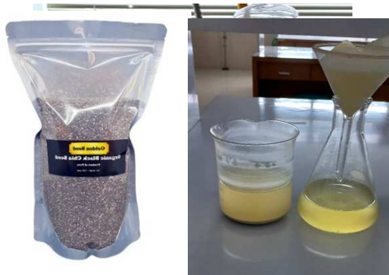
Figure 5. Chia Seeds