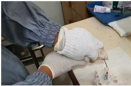
Figure 3. Sampling process