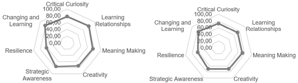
Figure 1. Profile 1 st and 2 nd application in Grades 7-9

In terms of moment of application, it is possible to acknowledge that the students' profiles per grade level (Figures 1 and 2) differ the most from each other in grades 7-9. The differences of profiles between grade levels in each moment was higher in the 2 nd application.