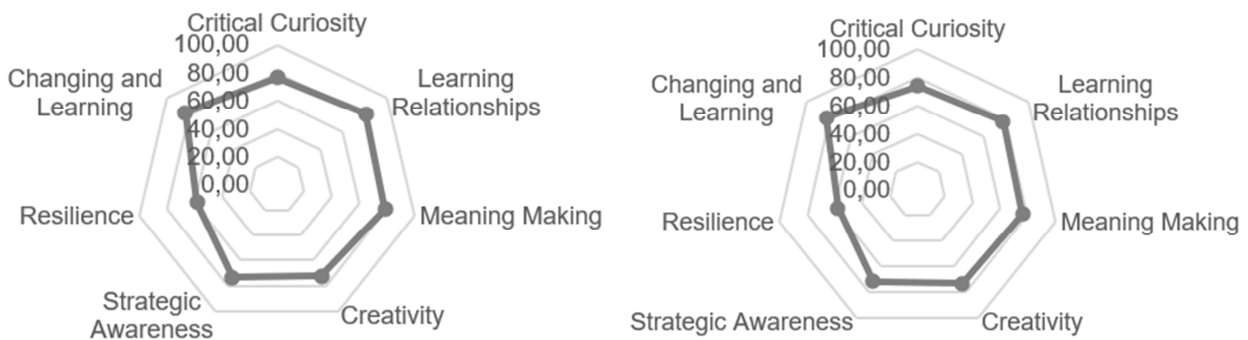
Figure 2. Profile 1 st and 2 nd application in Grades 10-12