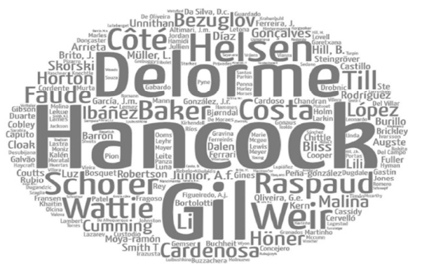
Figure 3. Word cloud of authors of selected studies

Kingdom as one of these combinations, as it is composed of more than one country. The country that developed the most research related to the RAE and invasion team sports was Spain with 14 studies, followed by Canada (8), Brazil (7), Germany (6), Portugal (5), Australia (5), England (5), France (3), United States (3), Norway (2), Belgium (2),