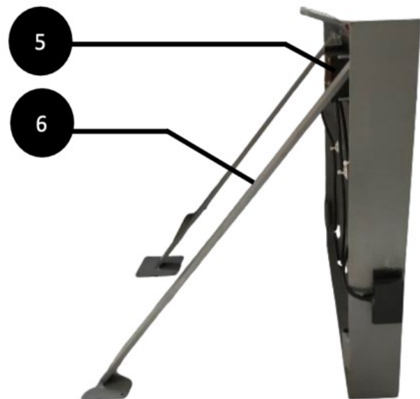
Figure 2. The Working System of The Device (Front View of MST Device)

Figure 2 illustrates the working system of the device consisting of some steps. (1) The device is activated by pressing the button on the box behind the target. (2) The button only needs to be pressed once, it does not need to be pressed and then held. (3) The sensor is active immediately. (4) The display will turn on immediately. (5) The sensor counts the number of times, and the number of bounce ball is coming. (6) The number of incoming reflections is displayed directly on display. Moreover, Figure 3 describes the complete kit design of the device using a microcontroller covering (1) Iron Target 50 x 50 cm, (2) 1 Unit Modification Coordination Test Device, (3) 2 Ultrasonic Sensors, (4) 1 Display dot matrix.