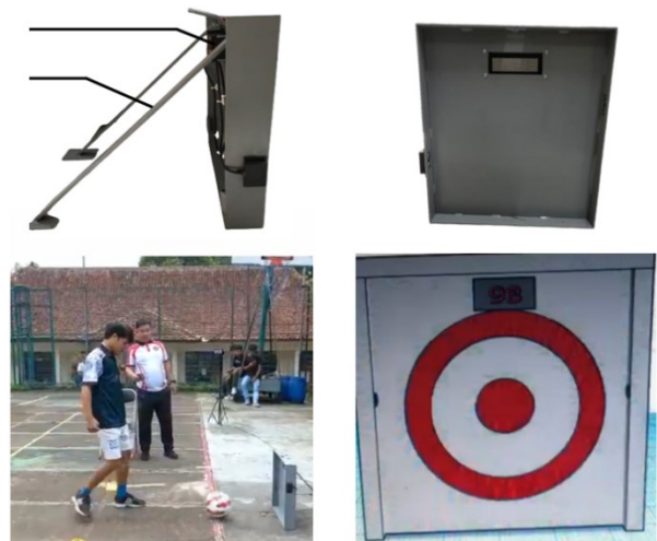
Figure 3. The Trial of Prototype Product of Modification Coordination Device

Trials of prototype products were conducted during the coordination process (see Figure 3). The working system of the device is manifested in some stages. (1) When the device is activated by pressing the button on the box behind the target. (2) The button only needs to be pressed once, it does not need to be pressed and then held. (3) The sensor is active immediately. (4) The display turns on immediately. (5) The sensor counts the number of times, and the number of ball bounces is coming. (6) The number of incoming reflections is displayed directly on the display criteria modification coordination test. The device is appropriate for athletes using foot and endurance sports players (e.g., football, futsal) but not for individuals who will coordinate the test. A degree of caution is required in admin-