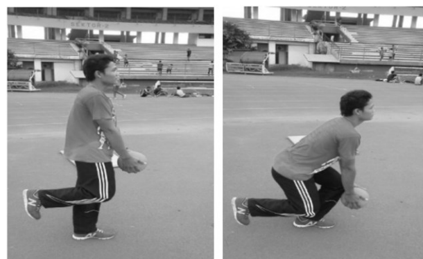
Figure 2. Single leg straight deadlift with medicine ball.