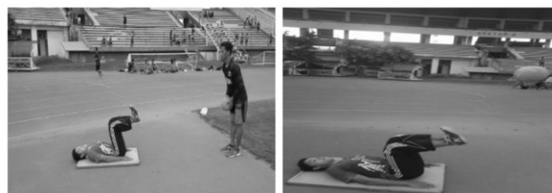
Figure 1. Stabilization exercises Leg Press with medicine ball.