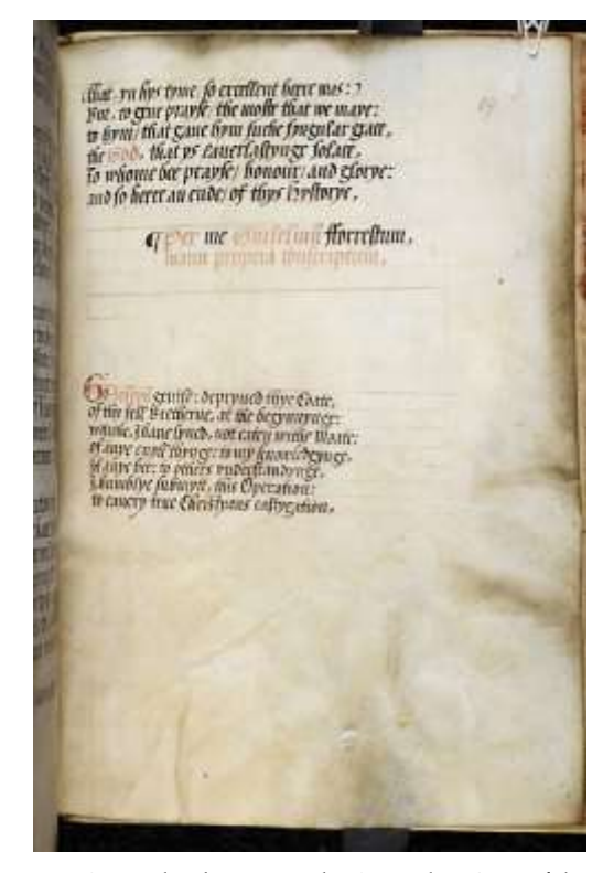
Fig. 1: MS Royal 18 C. xiii, fol. 19

In total eight manuscripts survive containing Forrest's works. What makes these manuscripts particularly distinctive is that they were all copied by Forrest himself. He has left a far larger body of autograph verse than survives for any other sixteenth-century English poet. In several of these manuscripts he specifically identifies them as copied in his own hand. Royal 18 C. xiii is described as "per me Guilelmum Forrestum manu propria conscriptum" (Fig. 1); elsewhere he describes his work as copied by "Wyllyam Forrest, Preiste, proprie manu" (Bodleian, Wood empt. 2, fol. 69v). In other manuscripts he subscribes his work simply "per me Gulielmum Forrestum" (Harley 1703, fol. 153) or "Quod william fforest" (Bodleian, Eng. poet. d. 9, fol. 157).