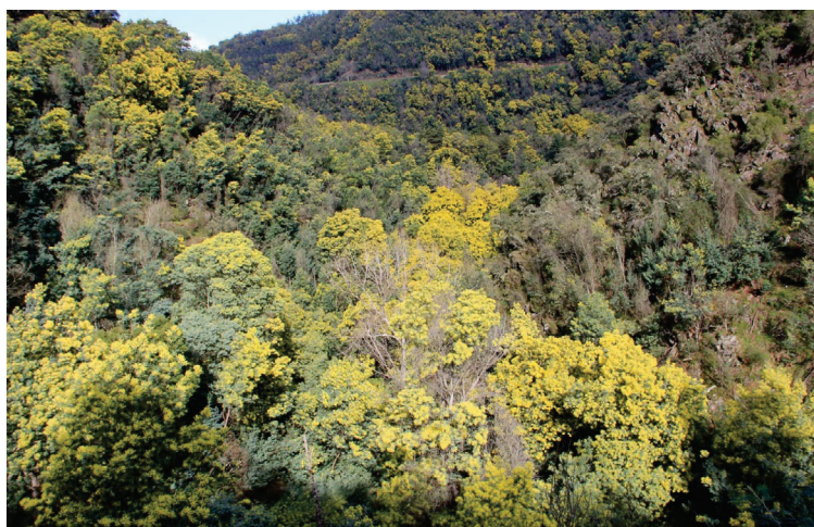
Figure 1. Image of a valley (São João stream) in the study area in Serra da Lousã, central Portugal, in February 2019, depicting heavy invasion by A. dealbata . A. dealbata is easily recognizable by its bright yellow flowers. Imagen de un valle (arroyo São João) en el área de estudio en la Serra da Lousã, centro de Portugal, en febrero del 2019, que muestra una fuerte invasión de A. dealbata. A. dealbata es fácilmente reconocible por sus flores de color amarillo brillante.

This study took place in Serra da Lousã, central Portugal, where invasive Acacia species (mainly