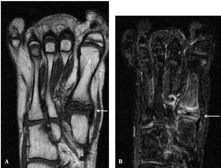
Figure 2. Magnetic resonance images one month after the onset of the symptoms. Changes in proximal epiphyseal density, reduced epiphyseal width (collapse), and enlargement with hyper- and hypodense areas are seen, consistent with avascular necrosis (arrows). A. T1-weighted image. B. T2 FSE (fast spin-echo) weighted fat saturated image.