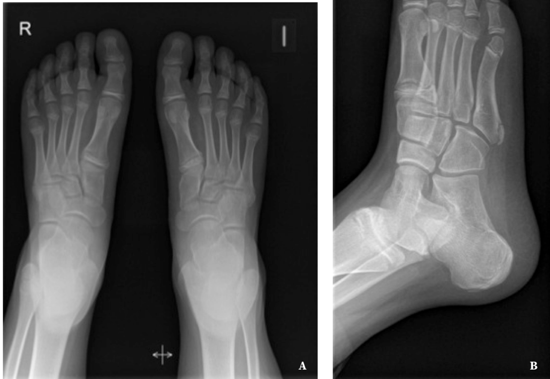
Figure 3. X-ray view, four years later, showing normal bone epiphysis without significant sequelae. A. Anteroposterior projection. B. Oblique view.