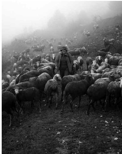
A female shepherd

Hence, on more than one occasion I came up against long silences which threatened to frustrate my intention to use a fully open interview. I planned to avoid the questionnaire approach as far as possible, but shepherds were sometimes expecting to hear specific questions in order to have something to tell me. This occurred above all in the first encounters. Conversations were much more natural and smoother after a certain rapport had been established.