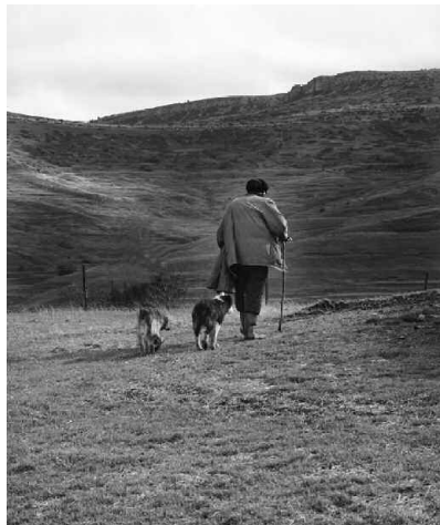
A shepherd with his dogs

The transhumant shepherds whom I interviewed are simple people who are humble and feel humble. They are good friends of their friends, reliable and very loyal. Their capacity for sacrifice and resignation is constantly put to the test, since apart from the disadvantages that have always existed (the cold, the rootlessness, the lack of means and comforts) we should not forget that they are the protagonists of a lifestyle going through a major process of change, which makes their work even more difficult and hard, if possible. Today's transhumant shepherd has to come to terms with the absolute devaluation of his sheeps' wool, but he nevertheless has to go on shearing them. Farmers no longer require the manure from his flocks, so it is the shepherd who has to clean the folds. The profits from the sale of lambs go down all the time. The paths which they travel along are semi-abandoned, with no farmsteads where they can enjoy a rest or meet people to say hello to on their way. And so on.