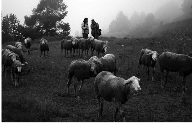
A female shepherd talking to the researcher

But can any generalisation be made from these sources? Or should anthropologists be content with particular knowledge? If we opt for restricting ourselves to the particular field, could we not be betraying our profound desire to understand ourselves as human beings?