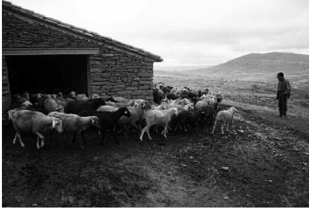
Shepherd taking his flock out of the pen

Hence, on more than one occasion I came up against long silences which threatened to frustrate my intention to use a fully open interview. I planned to avoid the questionnaire approach as far as possible, but shepherds were sometimes expecting to hear specific questions in order to have something to tell me. This occurred above all in the first encounters. Conversations were much more natural and smoother after a certain rapport had been established.