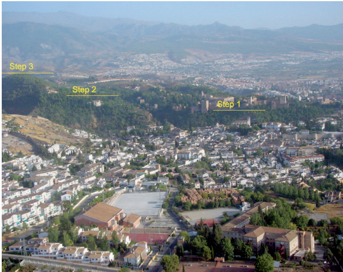
Figure 2. Topographic steps produced by the NW-SE normal faults. Figura 2. Escalones topográficos producidos por las fallas normales con orientación NO-SE.

at depths between 5 and 17 km (Morales et al. , 1997; Serrano et al. , 2002) and the focal mechanisms indicate a present-day stress state dominated by a NE-SW extensional axis. This extensional stress field coincides with palaeo-stress determinations from Tortonian and younger sediments, and is perfectly compatible with NW-SE striking normal faults and NE-SW directed extensional transport (Galindo-Zaldívar et al. , 1999; Martínez-Martínez et al. , 2002; Galindo-Zaldívar et al. , 2003). Taking into account the length of the seismic faults in the area (approximately 17 km) the “realistic” maximum magnitude of an earthquake would be 5.1 (De Miguel et al. , 1989; Peláez Montilla et al. , 2002). An earthquake of this magnitude at depths of 5 km would produce maximum